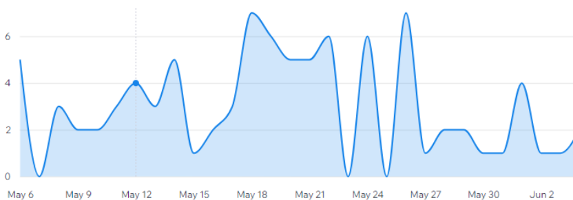
Sessions over time

Site sessions: A session is a visit to your site. It ends after 30 minutes of inactivity.